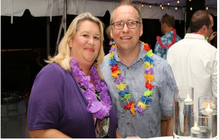
Leaders United helped coordinate the inaugural Tikis on the Terrace luau themed fundraising event. The event raised $17,000 for Martin County's Literacy Initiatives.