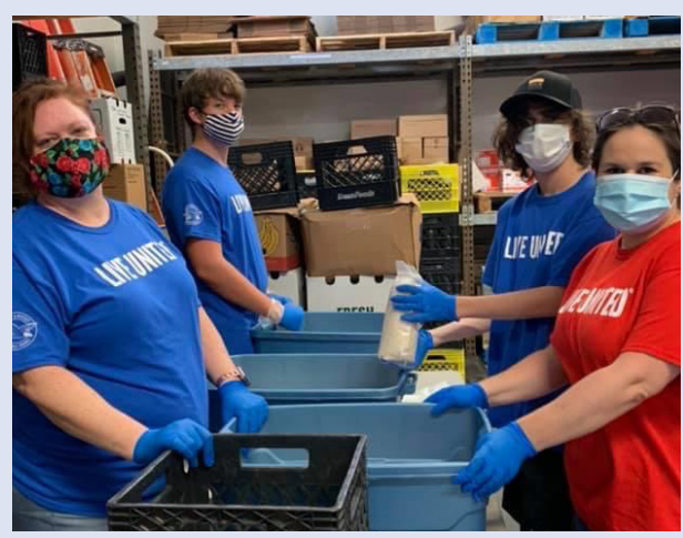
United Way of Martin County's LEADERS UNITED group volunteered at a food pantry during the pandemic.

Volunteer work is not only essential to helping the community respond and recover from a disaster, but it also provides a tangible economic benefit. The dollar value of every hour that volunteers spent in disaster recovery –from delivering meals to vulnerable seniors to making face masks for first responders -- can be applied to the local government's cost share for Federal Emergency Management Agency (FEMA) reimbursement.