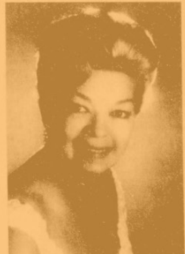
Frances Langford Stuart