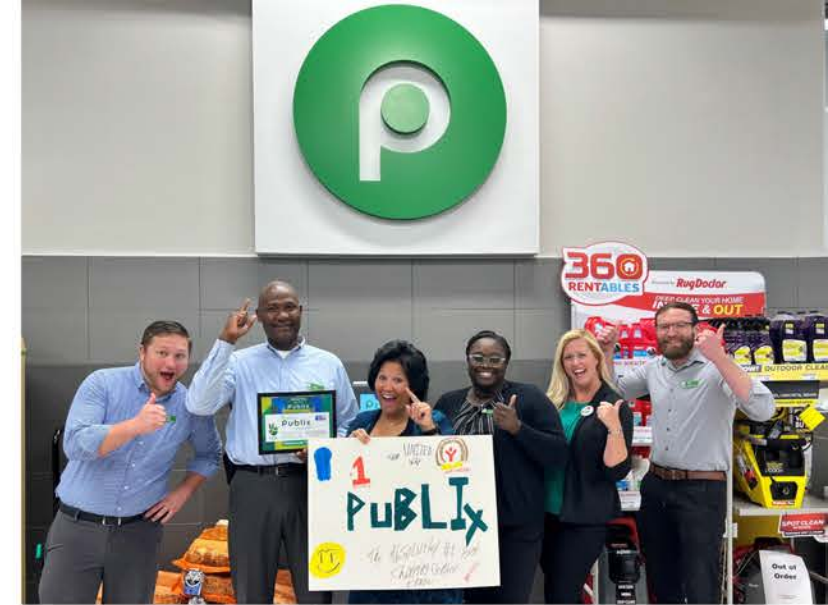
United Way of Martin County is a Top 10 Most Generous Workplace but is excluded from the listing.

While many United Ways rely heavily on workplace campaigns, the local gated communities in Martin County comprise more than half of the philanthropic giving to our annual campaign. The residents of Sailfish Point were once again honored with the title of Most Generous Community.