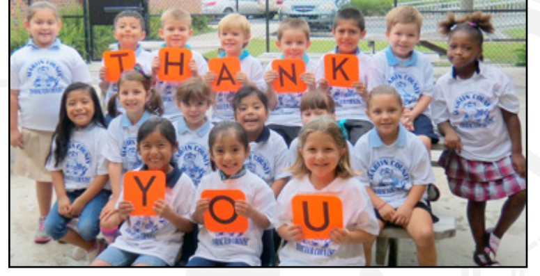
Kindergarten students at Pinewood Elementary School proudly wear their brand new CHARACTER COUNTS! T-shirts. 13 | United Way of Martin County 2012-13 Annual Report

While every attempt has been made to ensure the accuracy of this listing, we apologize for any errors or omissions. Please advise us of any corrections so we can recognize you next year.