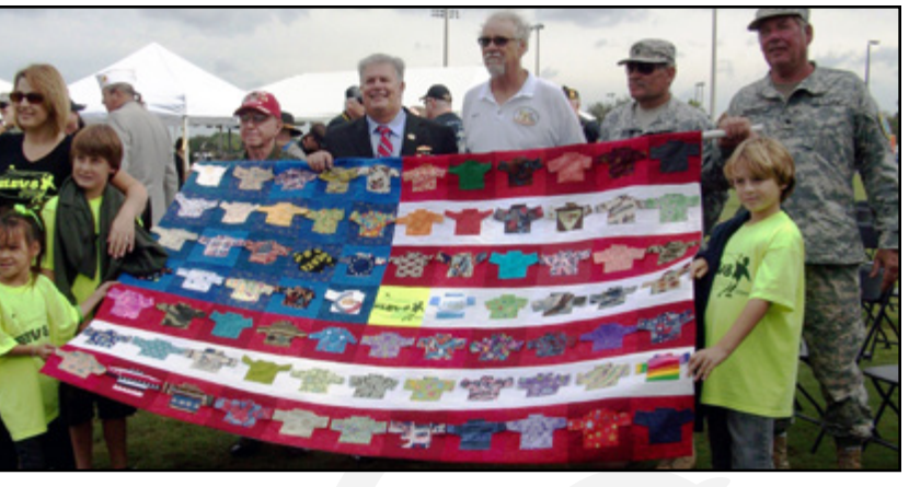
The Quilt of VALOR, created by Elev8Hope and Tykes & Teens and funded through a CHARACTER COUNTS! mini-grant, is displayed during the opening ceremony for the Vietnam Memorial Traveling Wall.