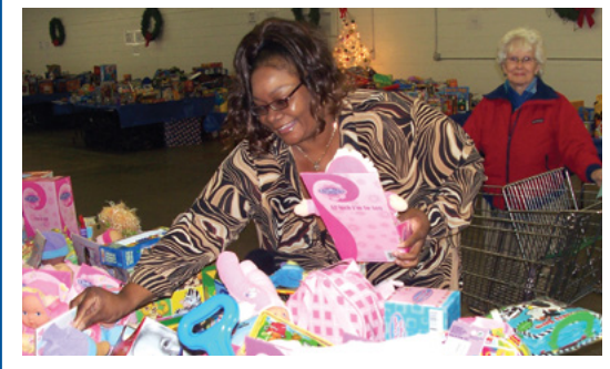
2013 White Doves Holiday Project Results

All activities of the ESC/TC are confidential, and thus organizations that have been helped cannot be publicized in this report.